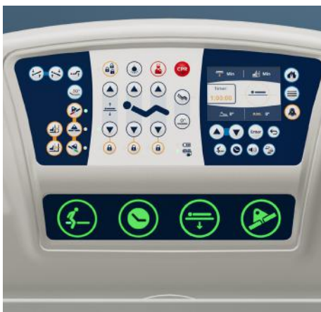
SafeGlance™: Four indicator lights give busy caregivers a quick view of critical safety features, including bed exit alarm, protocol timer, bed low and brake status – features that save time and make it easier to manage the complex needs of a full patient unit.