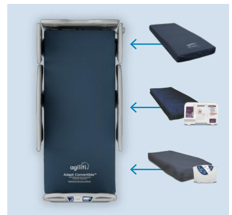
Support Surface Options: A flat deck and higher siderails means Essentia is compatible with a wide range of support surfaces, including more than a dozen Agiliti-manufactured foam and air options.