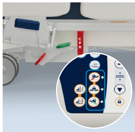
PowerBrake™ with AutoLock™: With three locations on the bed, caregivers can easily set casters to brake, neutral or steer with the press of a button. And with AutoLock, the brakes lock after 60 seconds whenever the bed is plugged in.