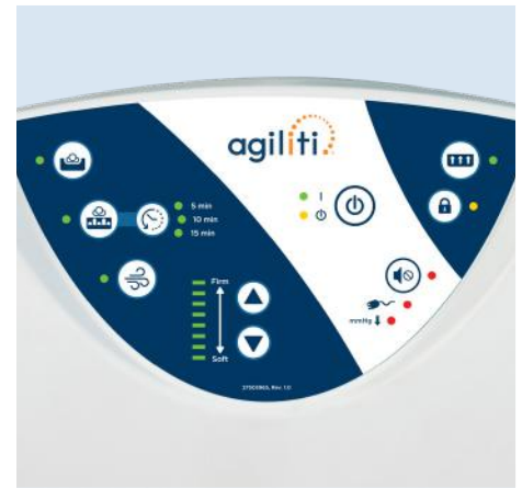
Quiet, small-profile pump works on all Adapt Line™ support surfaces