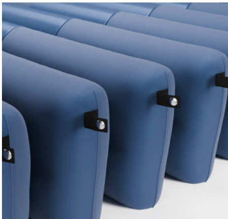
8" air cells provide 30% more immersion compared with 6" cells (Internal testing)

Adapt Air Pro offers a combination of unique features designed for optimal pressure injury treatment and prevention. The 8" air cells deliver 30% more immersion compared to similar 6" support surfaces, while offering two clinically effective therapy modes: 1-in-2 alternating pressure or powered immersion. The support surface also features Microclimate Assist™ and AirSpace™ 3D mesh, which together provide constant airflow to the 4-way stretch top cover, helping keep patients cool and dry.