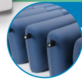
8" Air Cells

Adapt Air Pro offers a combination of unique features designed for optimal pressure injury treatment and prevention. The 8" air cells deliver 30% more immersion compared to similar 6" support surfaces, while offering two clinically effective therapy modes: 1-in-2 alternating pressure or powered immersion. The support surface also features Microclimate Assist™ and AirSpace™ 3D mesh, which together provide constant airflow to the 4-way stretch top cover, helping keep patients cool and dry.