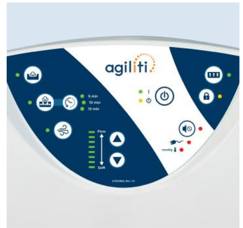
Easy-to-use pump allows for therapy selection and comfort adjustment