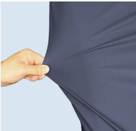
Performance fabrics and RF-welded seams boost durability and prevent fluid ingress

Adapt Air offers pressure injury prevention and treatment through two clinically effective therapy modes: 1-in-2 alternating pressure or powered immersion. In either mode, Microclimate Assist™ provides a constant flow of air to the support surface's top cover and proprietary AirSpace™ 3D mesh—helping keep patients cool and dry. The quiet, easy-to-use pump provides eight levels of customizable support and can be used on all Adapt Line™ support surfaces.