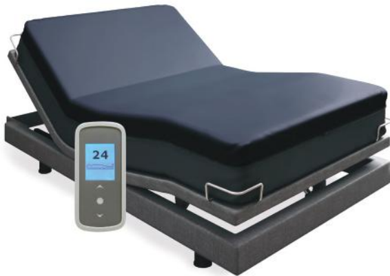
The Instant Comfort Sleep Lab Beds from Sizewise are air-adjustable beds with 45 levels of soft/firm comfort settings. The beds include an adjustable base.

Lisa Spear is associate editor of Sleep Review.