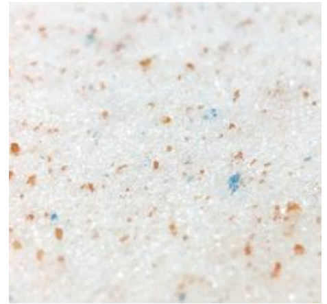
CuPro™ copper- and gel-infused foam helps enhance microclimate by dissipating heat and moisture