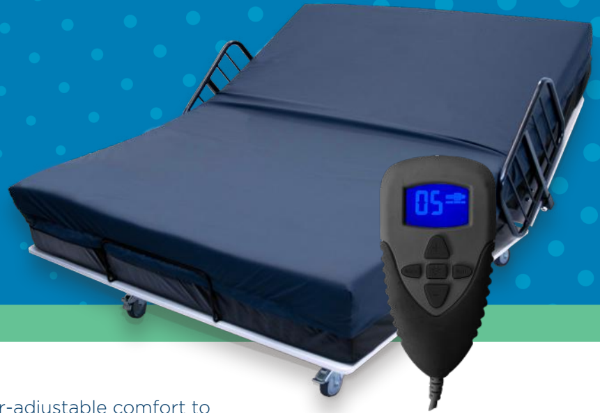
Shown with optional Adjustable Base™

Air-Adjustable Support Surface with Medical-Grade Top Cover