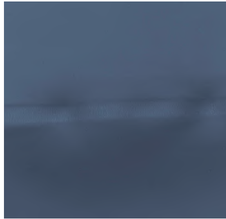
Performance fabrics, RF-welded seams and Core Shield™ improve durability and minimize risk of fluid ingress