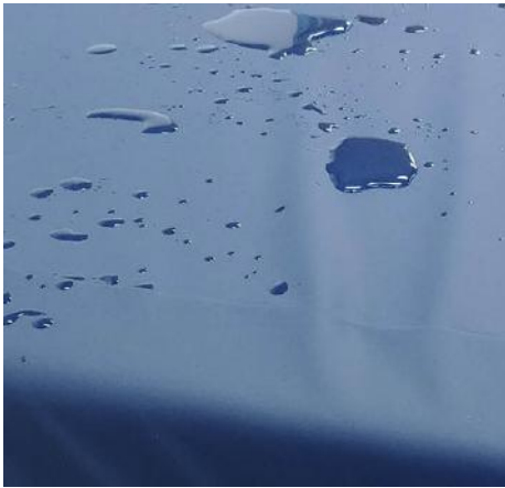
Medical-grade design and construction with consumer-grade features and comfort

Sleep Lab Bed features durable materials and air-adjustable comfort to support the unique needs of a busy sleep center. The mattress offers 45 levels of soft/firm adjustability to help provide patients with optimal sleep conditions during their study, while the wipeable top cover and RF-welded seams help protect the integrity of the surface for a longer useful life. Different mattress sizes and frame options are available to provide sleep labs with greater flexibility in addressing a wide range of patients.