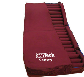
1400 Microvent LAL, Raised Bolsters