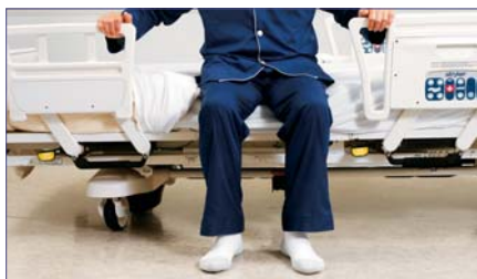
Intermediate siderail position and low bed height assist with patient entry and exit.