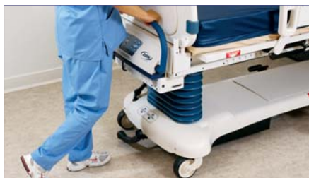
Optional Zoom® drive system minimizes the effort needed for patient transport while encouraging proper ergonomic posture.

The combination of Stryker's Chaperone bed exit system and Fall Prevention Program, coupled with the feature of bed retractability, form the most comprehensive fall prevention solution available.