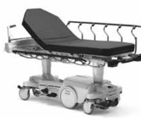
SM304 with Zoom Drive