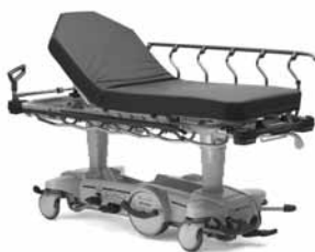
SM204 with Big Wheel