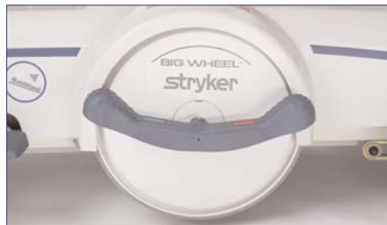
The SM204's Big Wheel® reduces start-up force by 50% and steering effort by 60%.