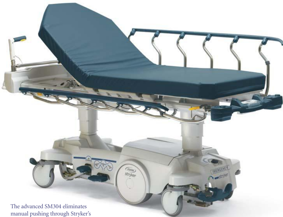
The advanced SM304 eliminates manual pushing through Stryker's Zoom® motorized technology.

Optional integrated scale system provides accurate, repeatable weights