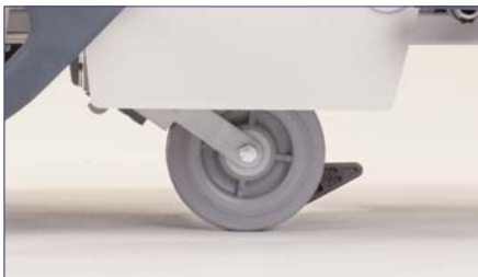
The SM104 uses a retractable fifth wheel to provide superior maneuverability and cornering.

Fully-equipped and completely adaptable, the M-Series allows you to choose the mobility solution that best suits your needs. Supremely mobile and user-friendly, these stretchers greatly reduce the physical strain on clinicians without sacrificing patient care and comfort.