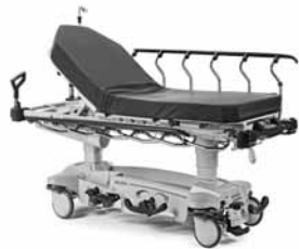
SM104 with Fifth Wheel