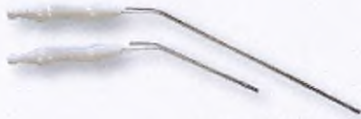
Disposable handpieces with integrated smoke evacuation