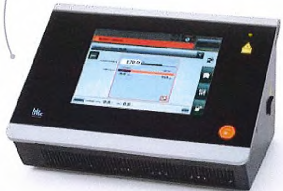
LEONARDO® DUAL 200 versatile & powerful