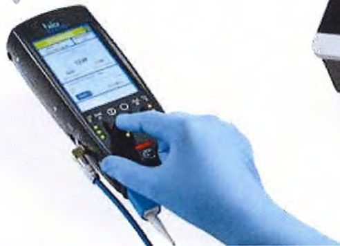
LEONARDO® Mini basic & specialist