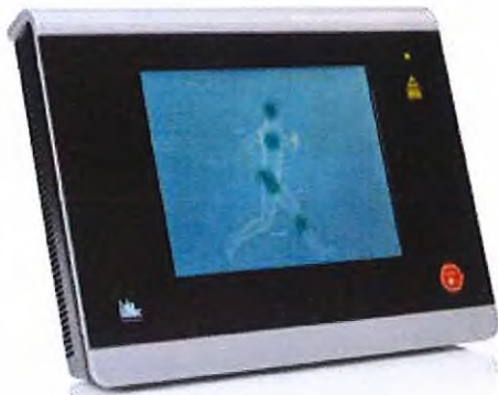
LEONARDO® DUAL 45 universal & ingenious