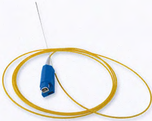
Bare Fiber 365µm Flat TIP