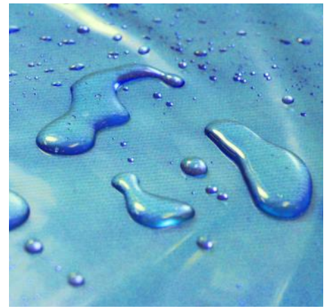
Core Shield™ minimizes risk of fluid ingress, extending surface life